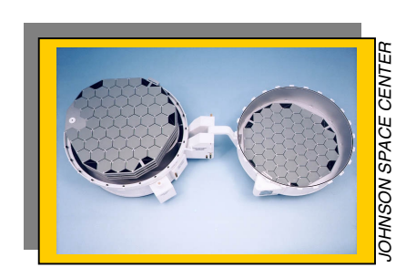
Solar Collector Wafers made of mostly silicon will be exposed to solar wind for two years.

One interesting application of the cleanliness of silicon is to compare the Genesisdiscovered information about the solar composition with that of certain kinds of meteorites that appear to be very similar in composition to the sun. Scientists are looking for a pattern in which the compositions of the solar wind and the meteorites agree for elements lighter than iron, but not for heavier elements.